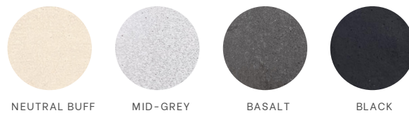
AVAILABLE IN FOUR VERSATILE COLOURS